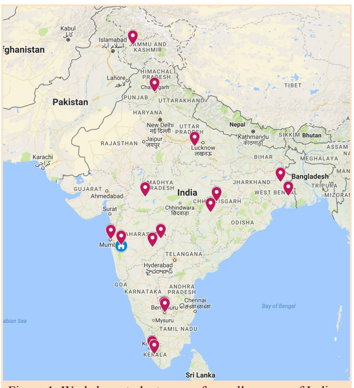
Figure 1: Workshop students came from all corners of India.

As is often the case during CIAO workshops, the learning process was not unidirectional; watching the students learn and search for information, and interact with the soft-